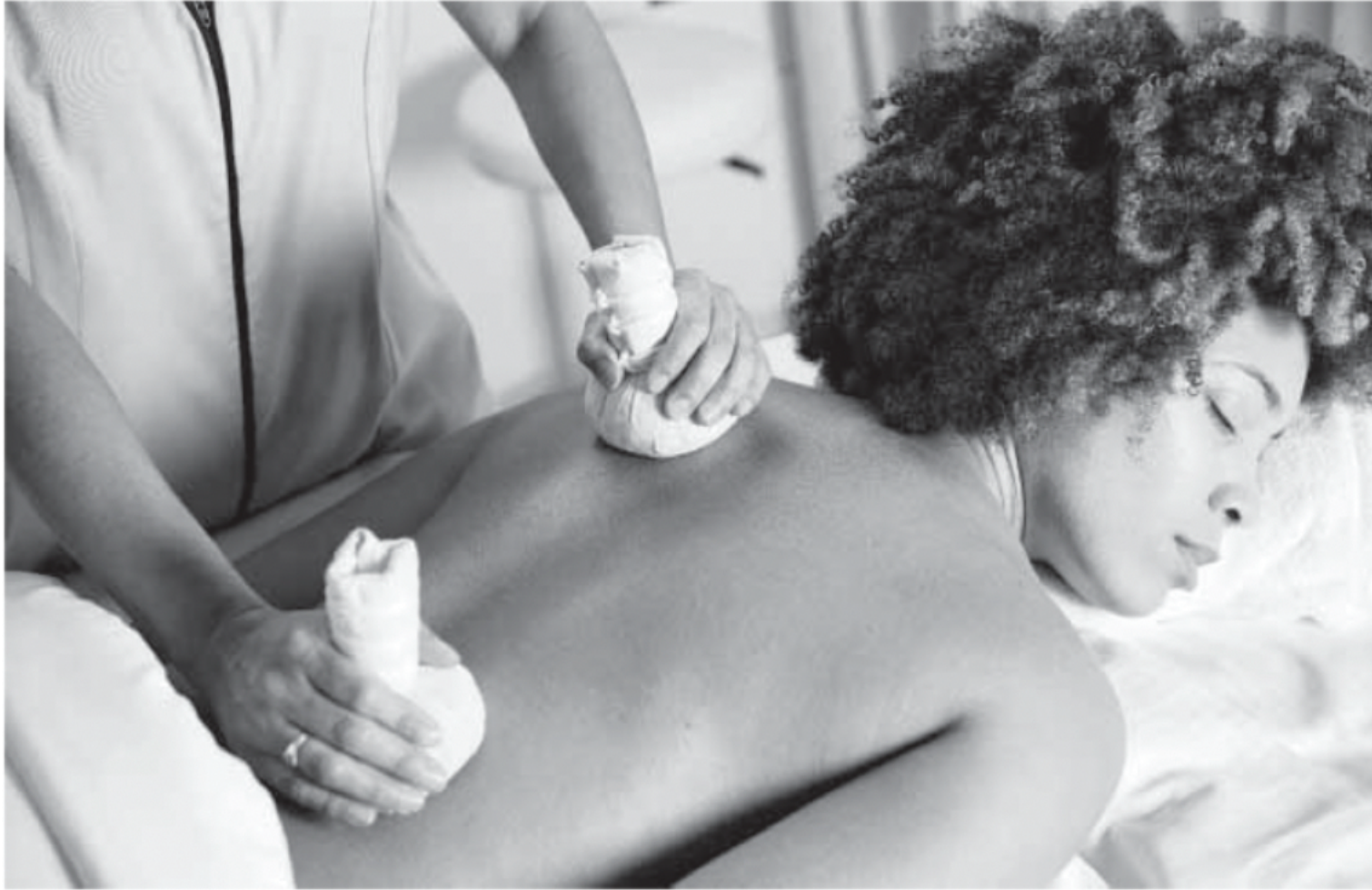
A client gets a Thai Muscle Recovery massage at âme Spa & Wellness Collective at JW Marriott Miami Turnberry Resort in Aventura, which is participating in Miami Spa Months.

Here are just a few examples of treatments you can try for a reduced rate: âme Spa & Wellness Collective at JW Marriott Miami Turnberry Resort, Aventura: Can't